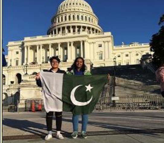
Passing Peace Forward in the Capital!

of 58 students for next year. Here are our benchmarks for the rest of this hosting season, for all of Mass Bay – as you can see we are starting earlier with higher benchmarks, and will finish early as well!