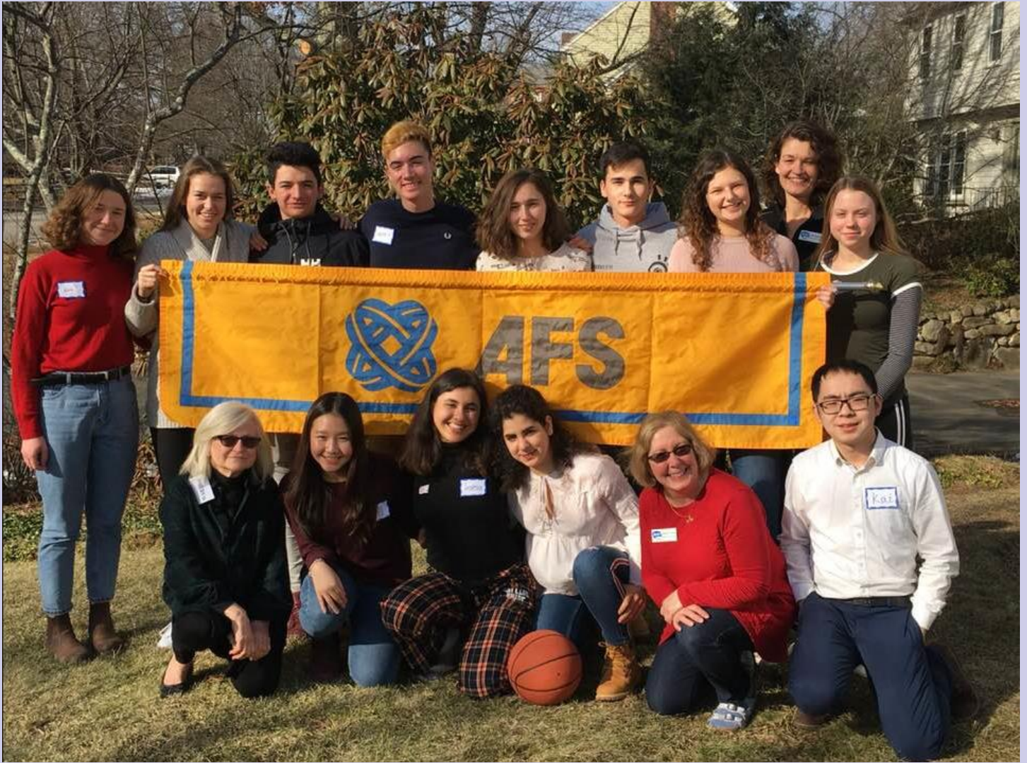
Metro West kids and volunteers at their Mid-stay Orientation!