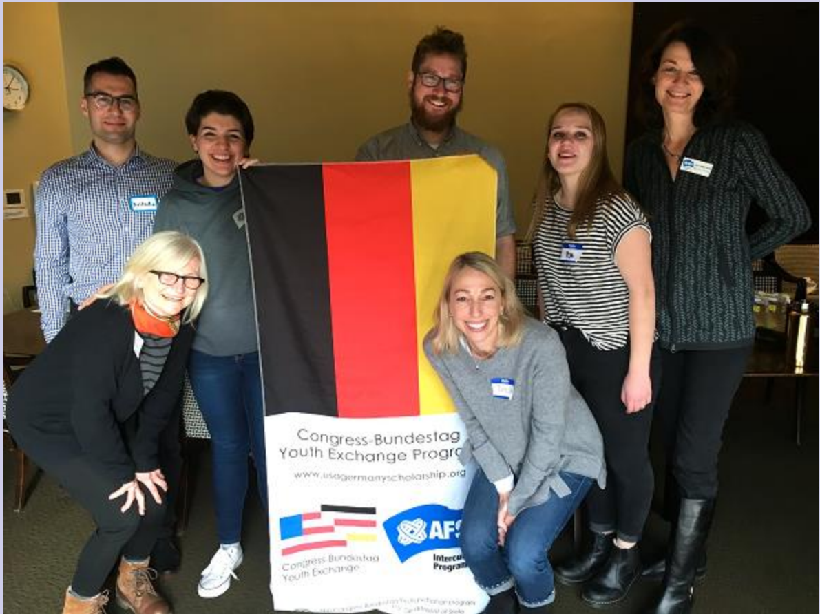
Some of our illustrious CBYX interviewers!