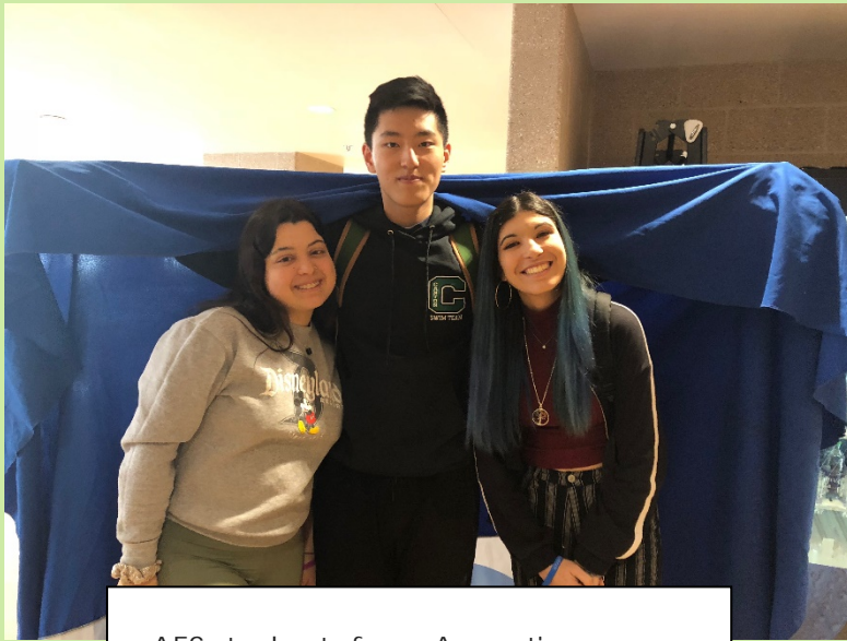
AFS students from Argentina, China, and Italy presenting at Canton High School!