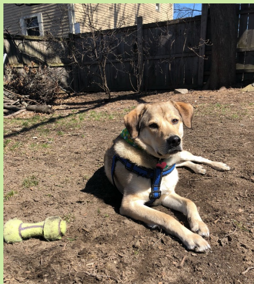
Hanko waiting patiently for warmer weather (and for the grass to grow back).